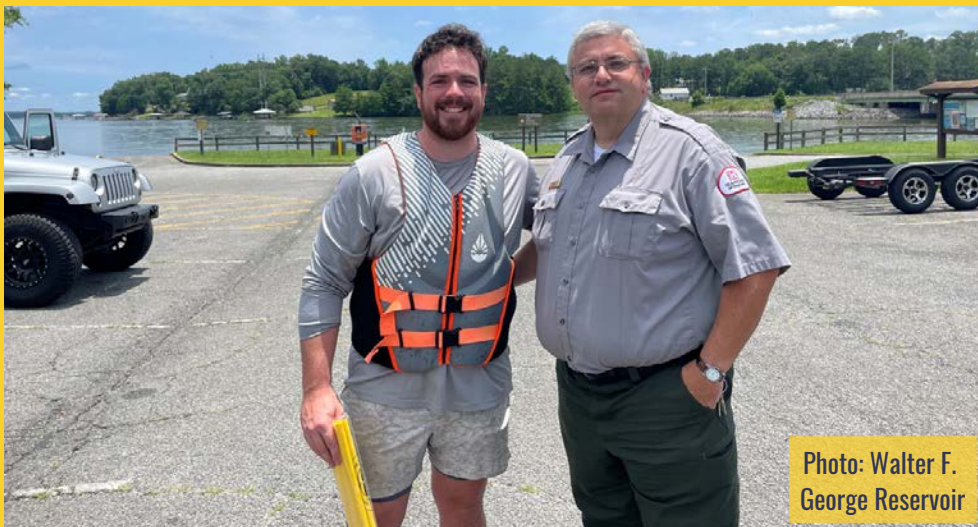
Photo: Walter F. George Reservoir

Keep up the great work catching adults wearing life jackets!